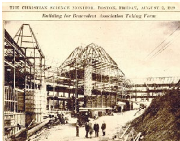
Arden Wood in the 1930s; Henry Gutterson, architect; AW construction site