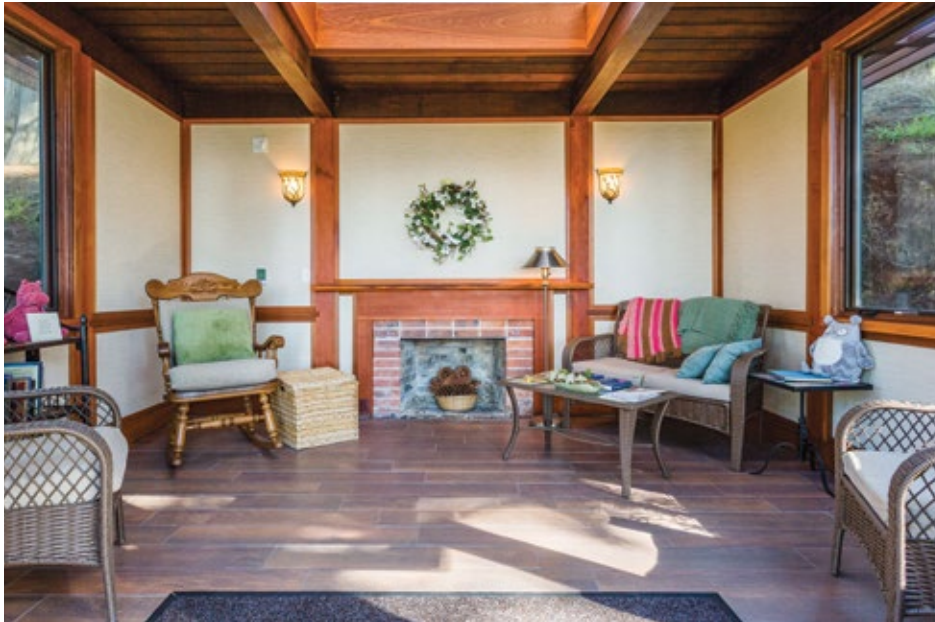
Arden Wood today; recently renovated Shelt'ring Wing